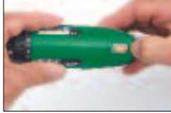
Battery Condition Indicator