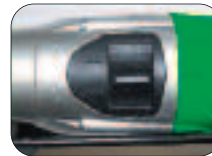
Rotary or hammer action