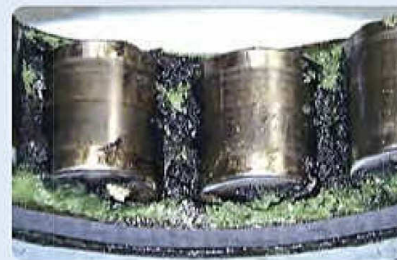
Lubricant degradation caused by electrical discharge currents